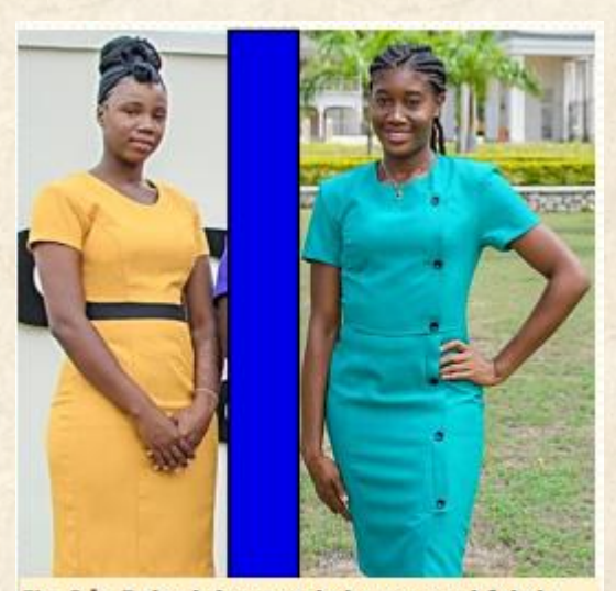
Fig. 2 L: Belted dress style in mustard fabric. R: Buttoned style (teal fabric no longer used ); royal blue colour shown between photos

For additional information please contact the Department of Student Services: <u>Student.services@themico.edu.jm</u> 1 (876) 764-2748/2836/2796