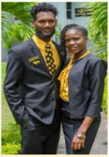
Fig. 1 Uniform for Official Functions and Practicum

optional black blazer (single-breasted, 2-button, notch lapel, welt or flap pocket)